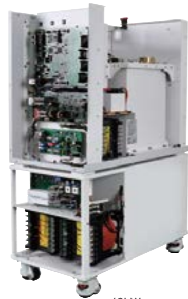
40kW Capacitor powered