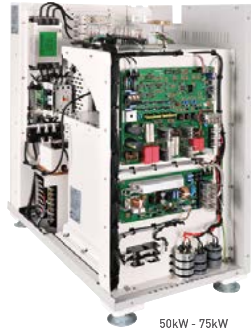
50kW - 75kW